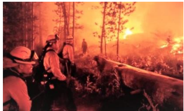
Along SR-50 Near So. Lake Tahoe (above)

The rest of these photos were taken randomly on Hwy 50 and in the South Lake Tahoe Region.